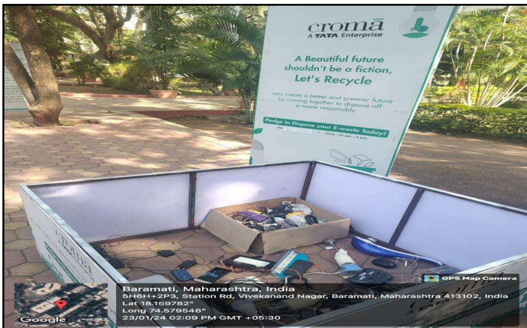
Collected E-waste materials are kept in a big box for recycle