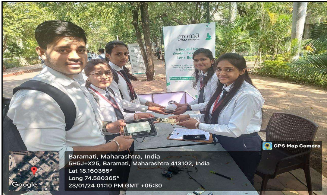
Students submitting their e-waste goods at the collection point