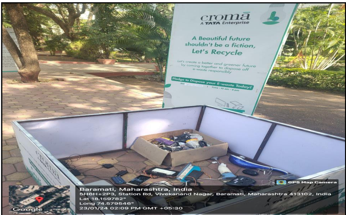
Collected E-waste materials are kept in a big box for recycle