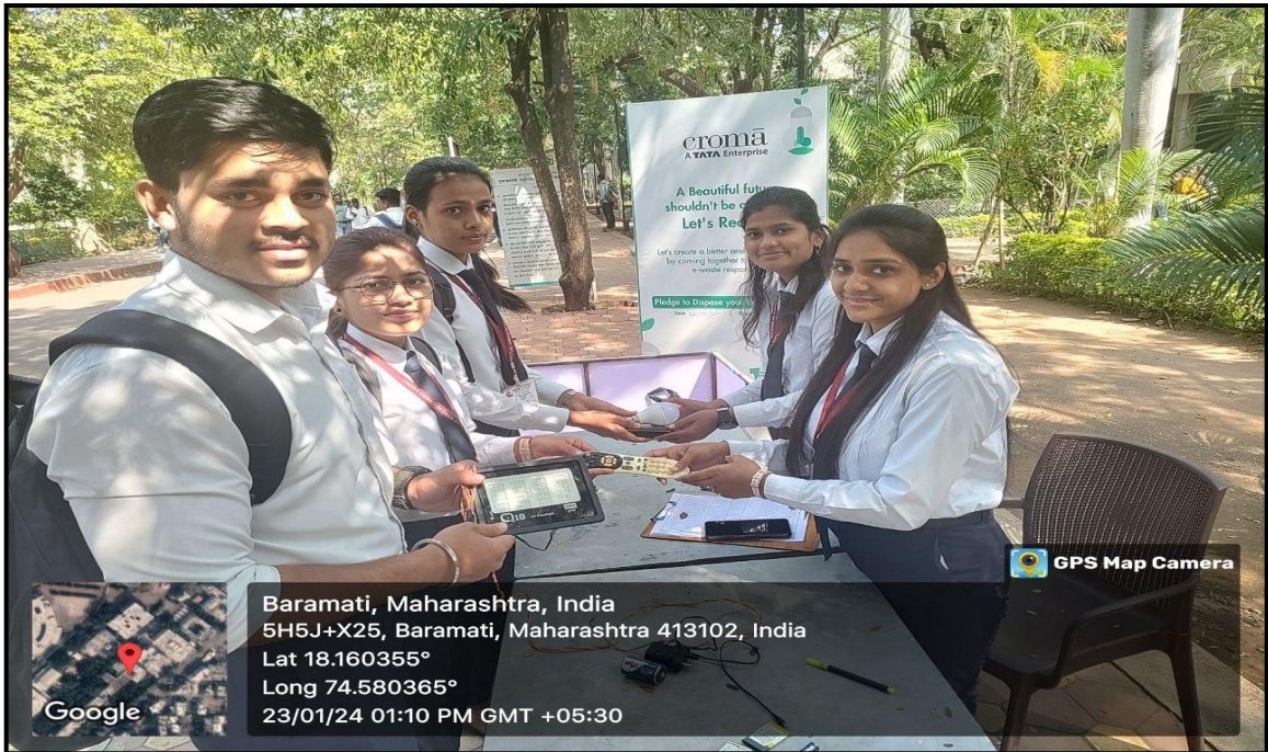
Students submitting their e-waste goods at the collection point