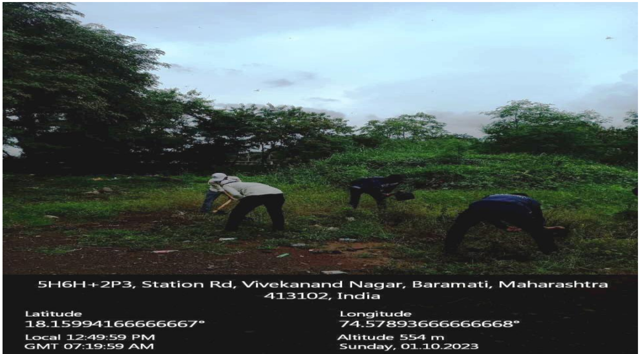
Students participating in Plastic Free Campus Drive on 1* October 2023

5H6H+2P3, Station Rd, Vivekanand Nagar, Baramati, Maharashtra 413102, India