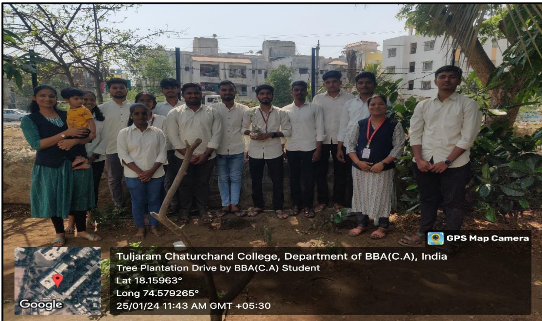
Participation of BBA (CA) teachers and students in Tree Plantation Drive