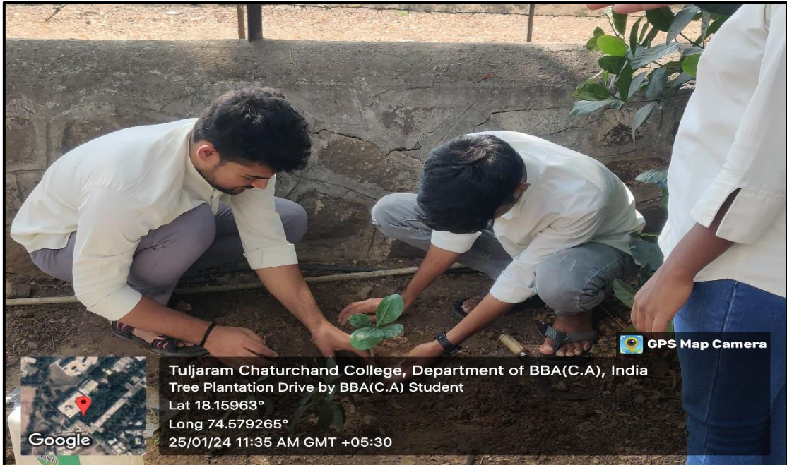
Trees exhale for us