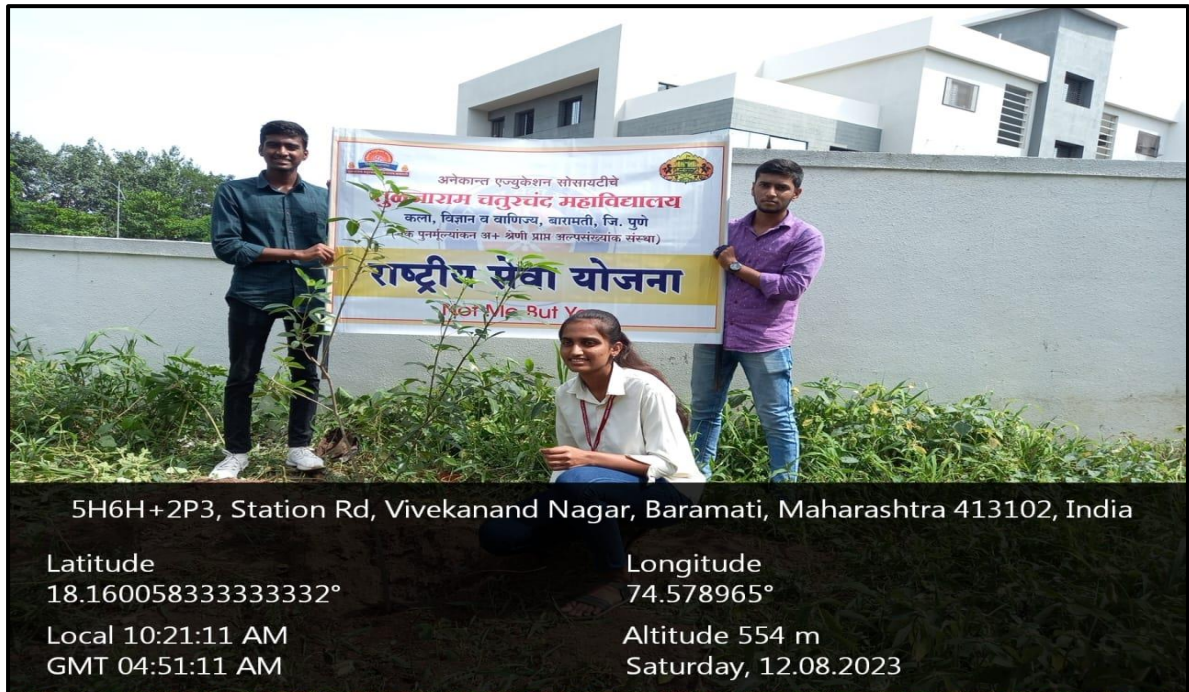
Tree plantation drive run by NSS