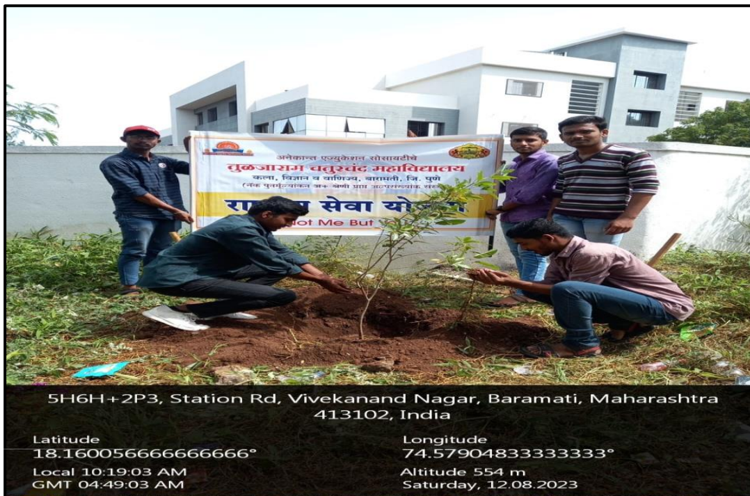
NSS volunteers in tree plantation drive

Tree plantation is a powerful tool for combating climate change, protecting ecosystem and fostering healthier communities. Regular tree plantation contributes to global reforestation efforts and make our earth cleaner and greener. Also, tree plantation helps in enhancing the beauty of the college campus. Underscoring the importance of trees in our life the NSS team of TuljaramChaturchand College actively participated in plantation of 200 different types of trees at the outside of college campus on 12/08/2023. NSS program officer Dr. Vilas Kardile accompanied the volunteers in this activity.