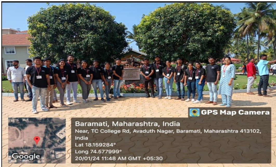
Students at Krushik 2024