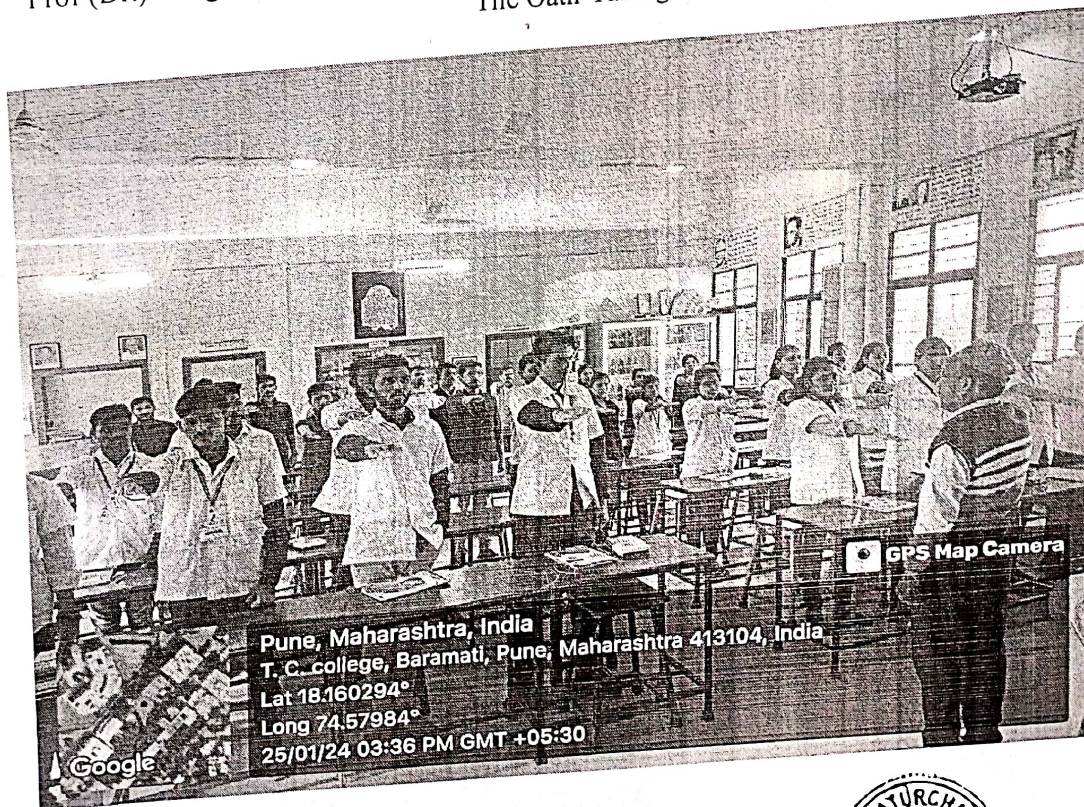
Oath-Taking on Voters Day on 25 th Jan 2024