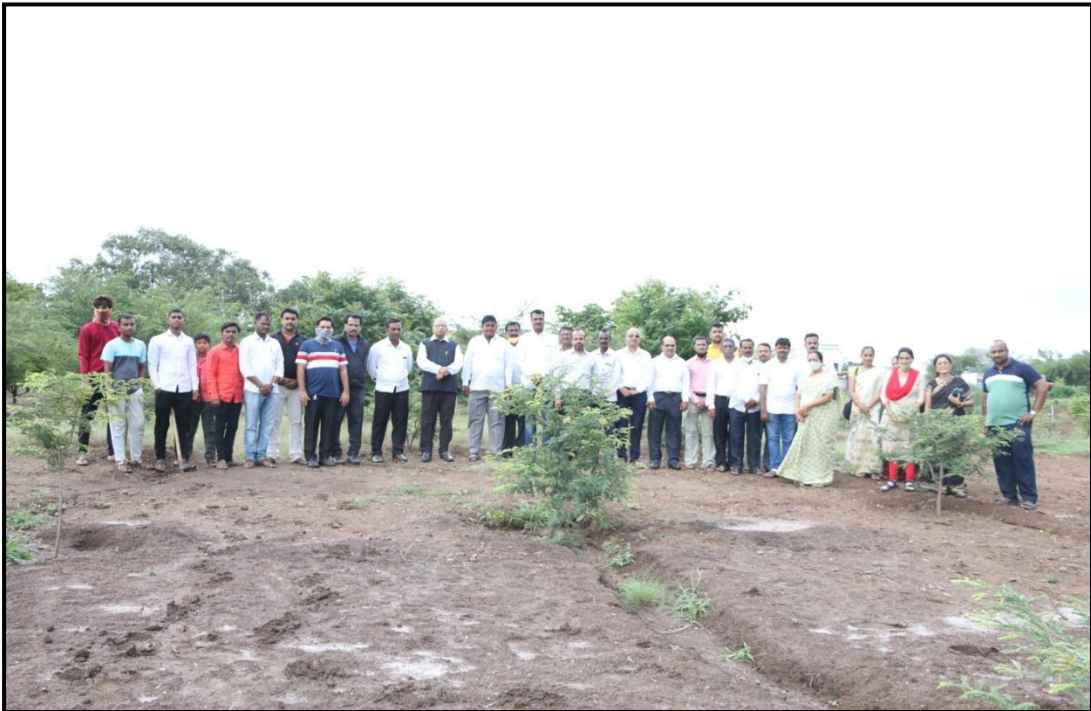
Group photo of T.C.College staff and villagers from Asu