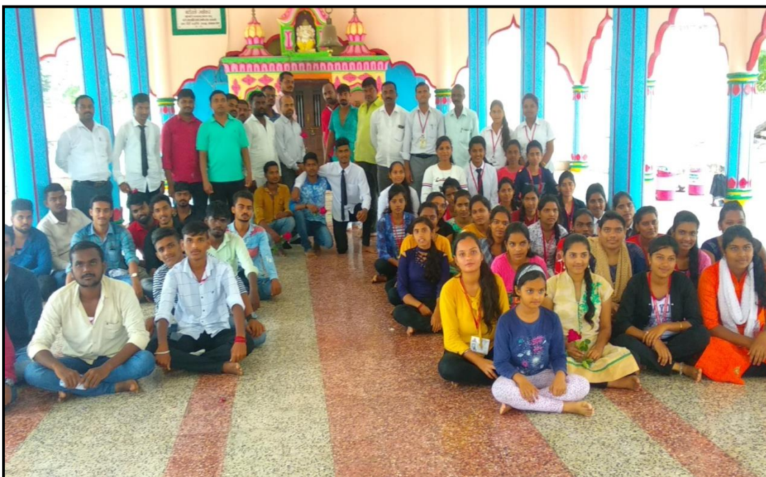
Group photo of students and teachers at the village temple