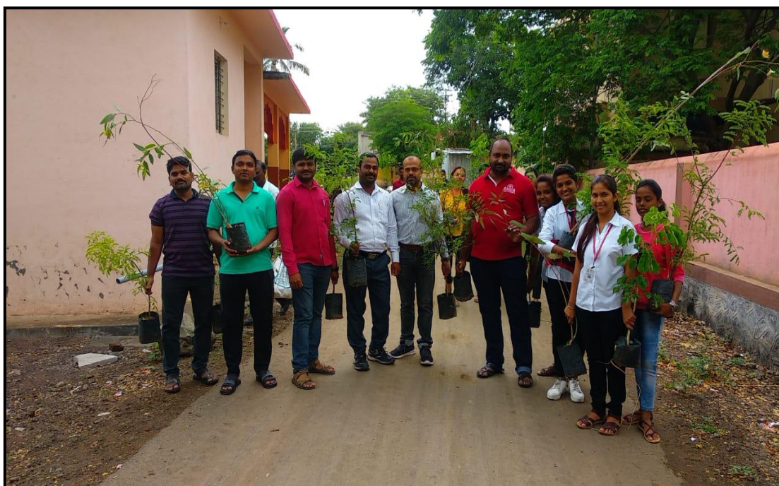
Teachers and students carrying tree saplings for plantation

Tree plantation is a powerful tool for combating climate change, protecting ecosystem and fostering healthier communities. Regular tree plantation contributes to global reforestation efforts and make our earth cleaner and greener. Also, tree plantation helps in enhancing the beauty of the college campus. The Economics department of the college carried out a tree plantation drive at Asu village in Phaltan Tehsil. The village is a historical place situated near the banks of Nira river. The plantation was conducted to protect our environment, to promote biodiversity, and raise awareness about the importance of trees in mitigating climate change. The drive was organized on 5 th September 2021 with the support of college authorities, villagers of Asu gram panchayat, faculty members, and student of Economics department.