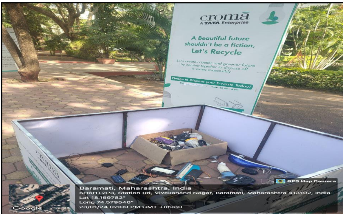
Collected E-waste materials are kept in a big box for recycle