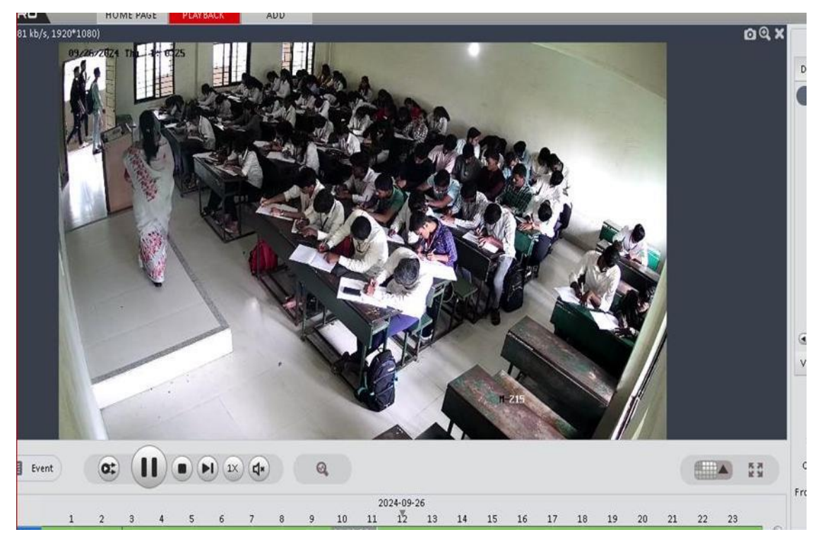
CCTV Surveillance Monitoring