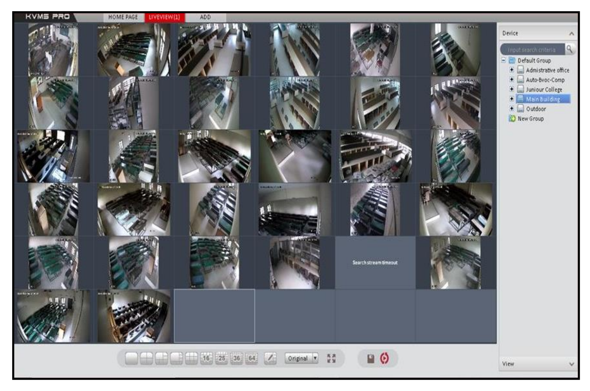
Centralized CCTV Survailence Monitoring