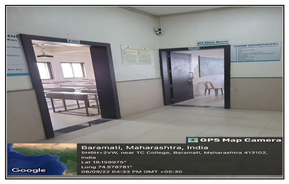
CCTV at outside of classrooms