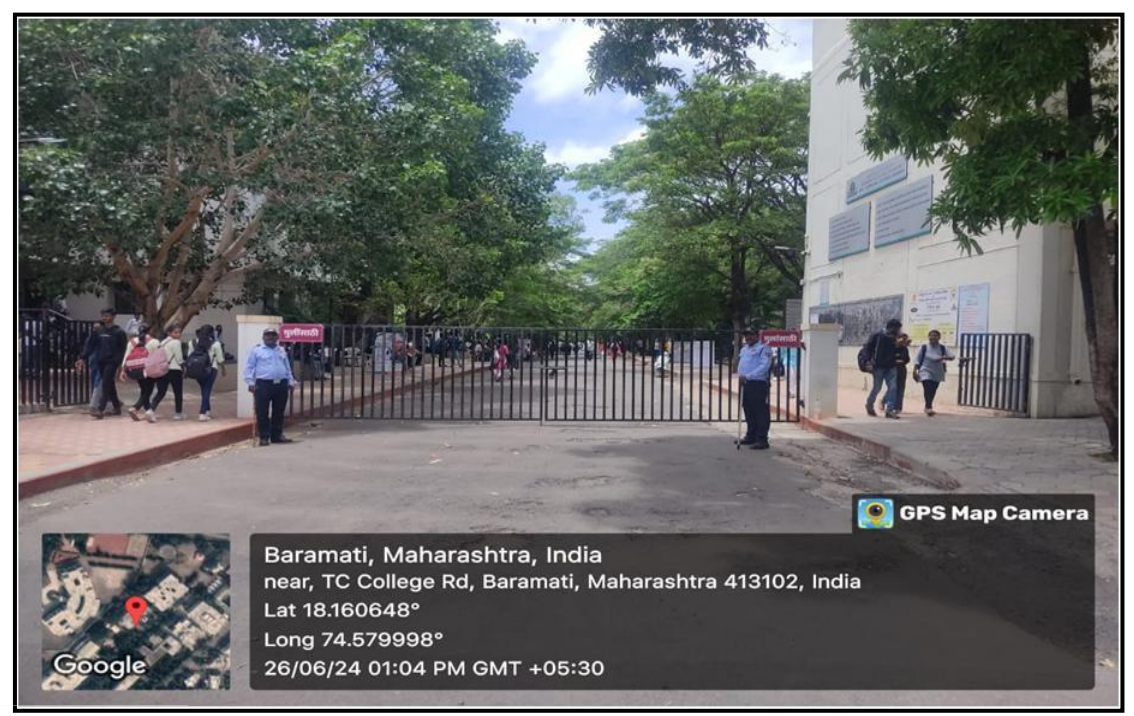
Guards at Internal Security Gate