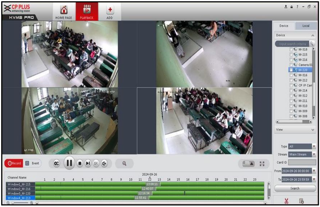
CCTV Surveillance Monitoring of Classrooms