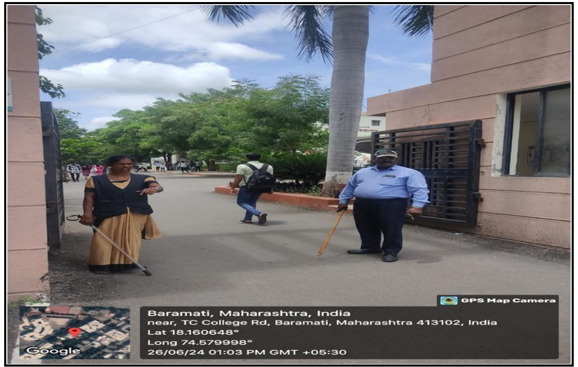
Male and Female Security Guards at Main Entry gate