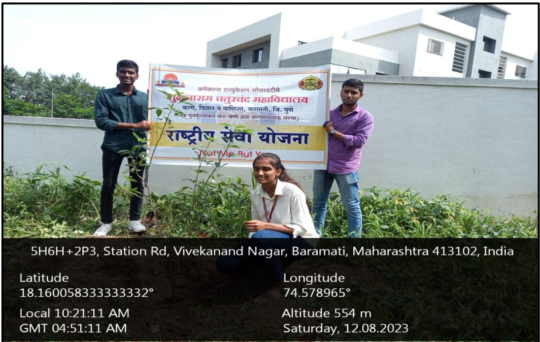
Tree plantation drive run by NSS