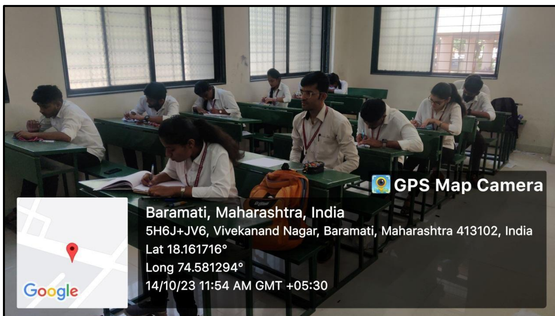
Students participating in blog writing competition