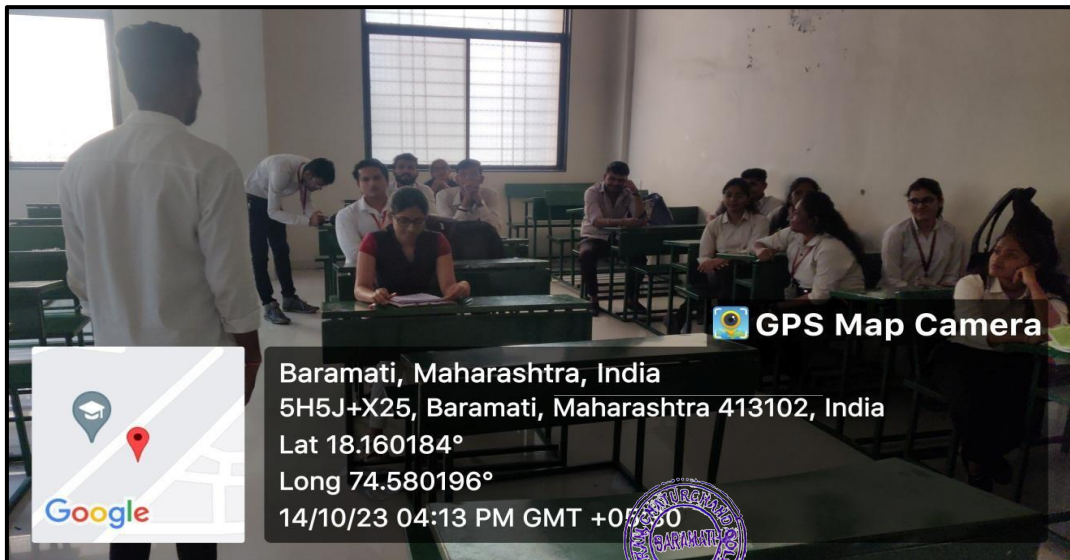
Students in speech competition on celebration of World Food Day 2023

World Food Day is an international day celebrated every year worldwide on 16 th October to commemorate the date of the founding of the United Nations food and Agricultural Organization in 1945. The day is also observed to tackle the global hunger crisis and to promote the message that food is fundamental and basic human rights. On this occasion the Department of Food Technology and Research organized different competitions to create awareness about the significance of diversity, nutrition, affordability, and safety of food. The department, in collaboration with AFSTI Pune Chapter, conducted three competitions for the students addressing the theme of World Food Day 2023: Water is Food, Water is Life, No One Leave Behind. The competitions were conducted under the observation of Dr. Wazid Khan, head Food Technology department. In total, 32 students took part in the competitions like Speech Making Competition, Blog Writing and Start-Up-Idea Competition.