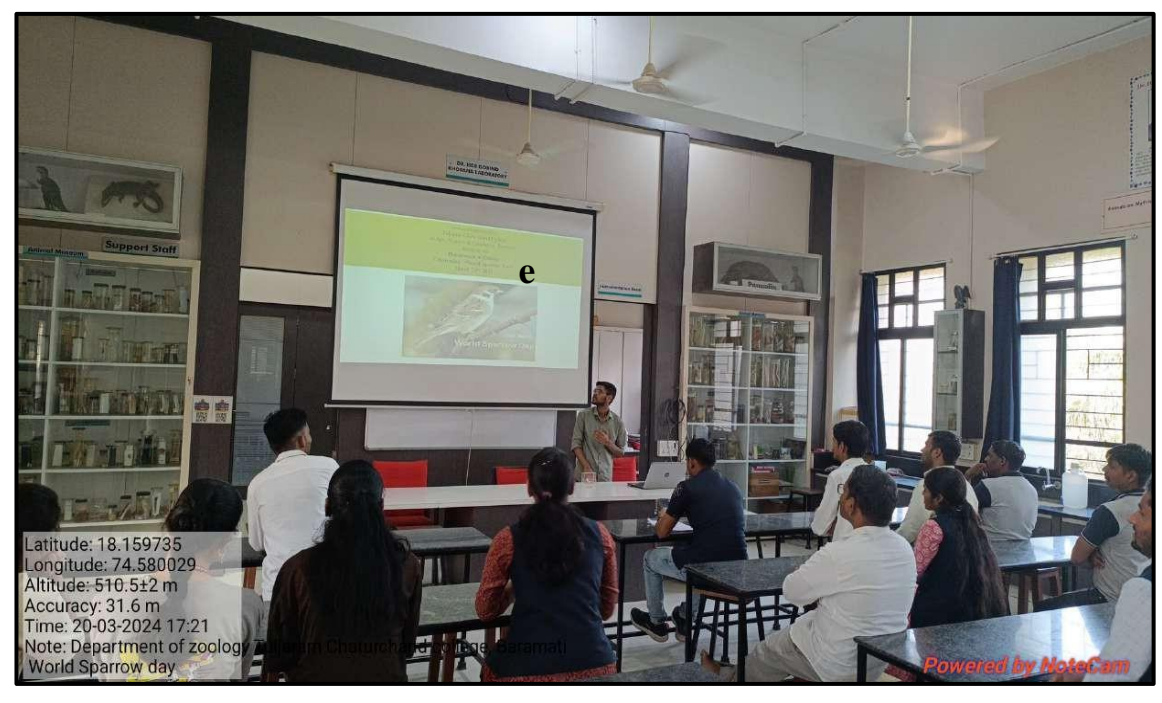
Experts giving information on importance of sparrow