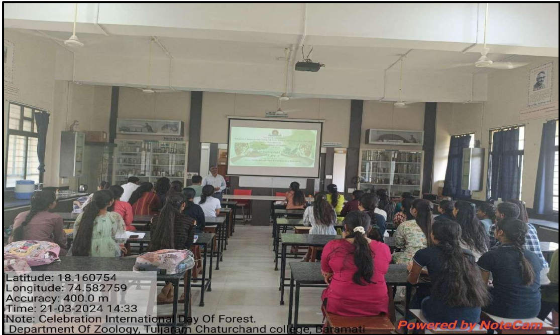
Experts' talk on conservation of forest