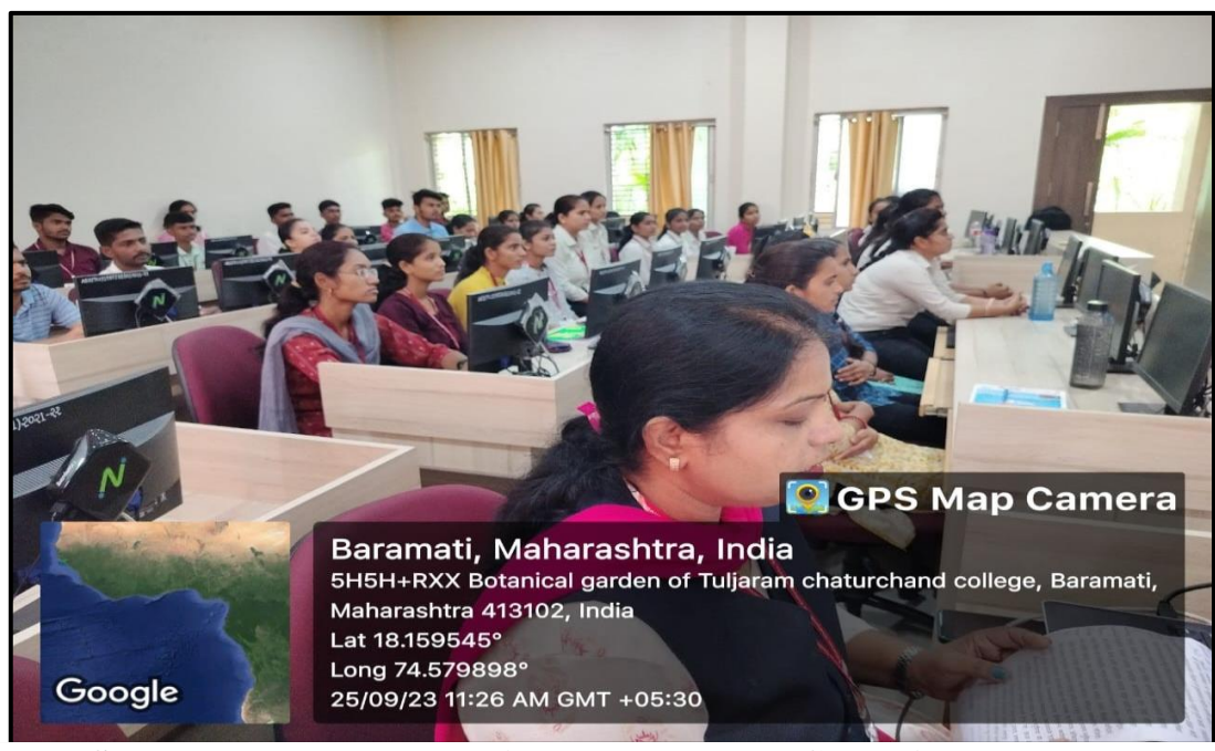
Students and techers watching the lecture on LCD projector screen