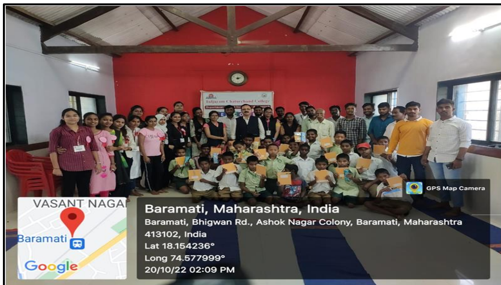
Celebration of World Food Day 2022 at Boys Orphanage, Baramati