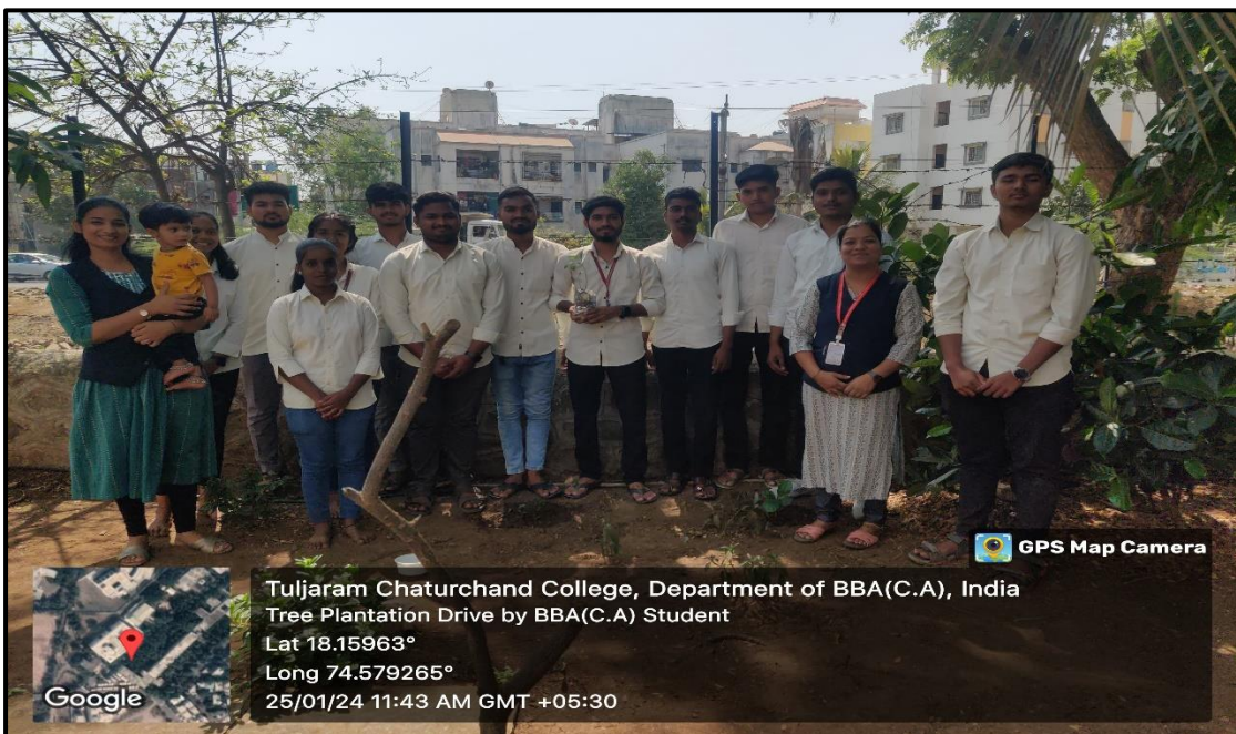
Participation of BBA (CA) teachers and students in Tree Plantation Drive