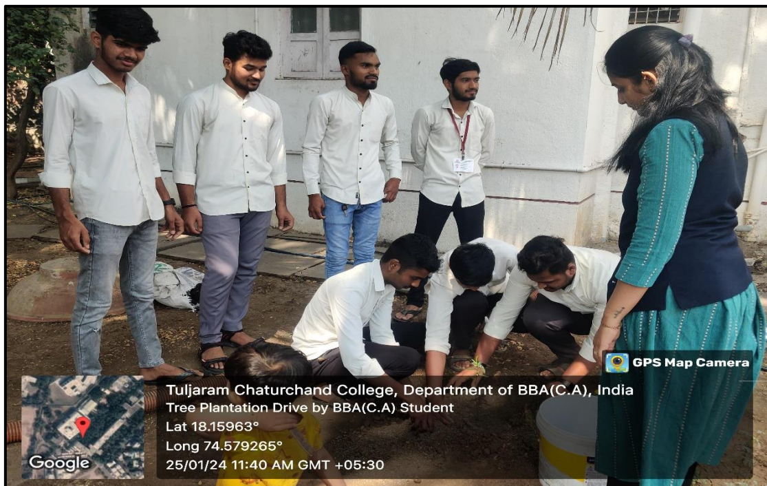
Students planting trees in the college campus

Tree plantation is a powerful tool for combating climate change, protecting ecosystem and fostering healthier communities. Regular tree plantation contributes to global reforestation efforts and make our earth cleaner and greener. Also, tree plantation helps in enhancing the beauty of the college campus. Underscoring the importance of trees in our life the BBA (CA) department carried out a tree plantation drive to increase green cover on campus, promote biodiversity, and raise awareness about the importance of trees in mitigating climate change. The drive was organized on 26 th August 2023 with the support of college authorities, faculty members, and student volunteers. In total 18 students gave their active participation to make the activity a huge success.