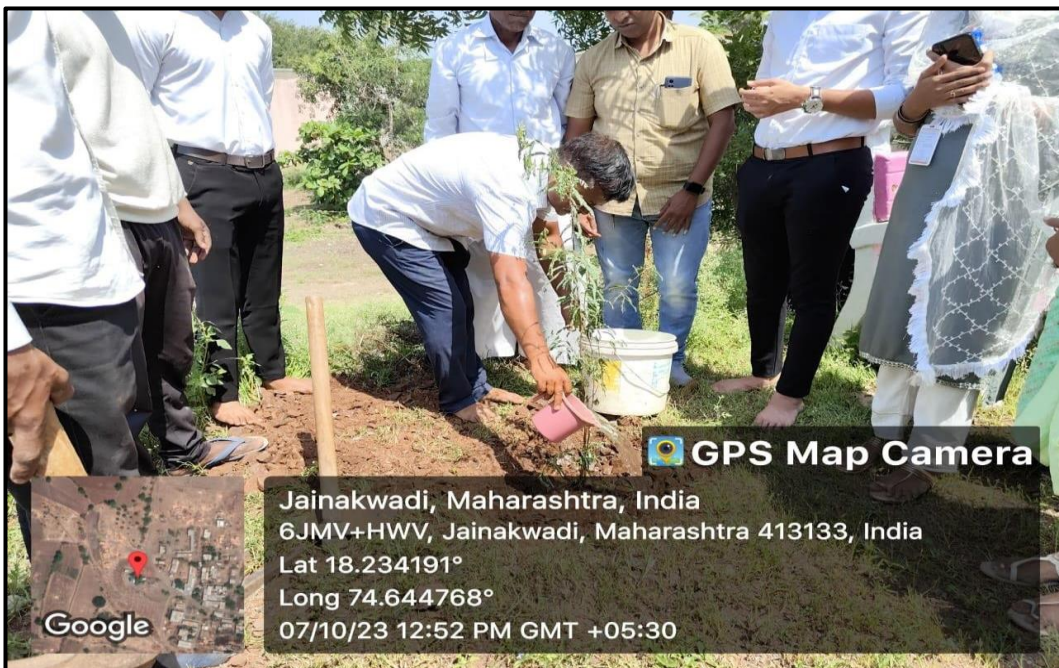
BBA teachers and students in Tree Plantation Drive