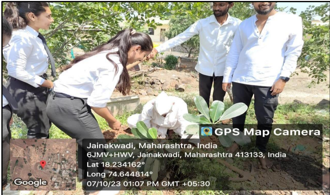
Tree plantation activity at Jainakwadi, Grampanchyat