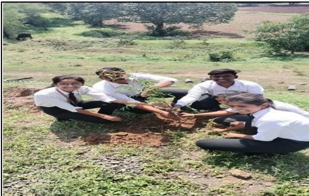
BBA students planting trees at Jainakwadi

Tree plantation is a powerful tool for combating climate change, protecting ecosystem and fostering healthier communities. Regular tree plantation contributes to global reforestation efforts and make our earth cleaner and greener. Also, tree plantation helps in enhancing the beauty of the place. Underscoring the importance of trees in our life the BBA department carried out a tree plantation drive at Jainakwadi, a small village near Baramati to increase green cover, promote biodiversity, and raise awareness about the importance of trees in mitigating climate change. The drive was organized on 7 th October 2023 with the support of college authorities, faculty members, and student volunteers. In total 21 students gave their active participation to make the activity a huge success.