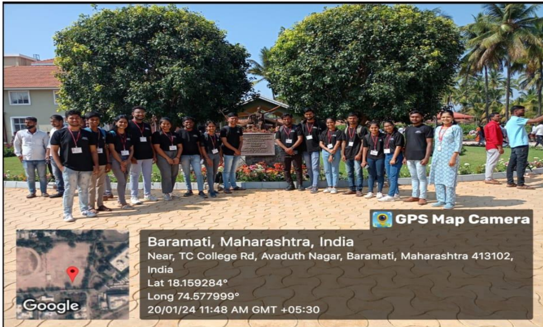
Students at Krushik 2024