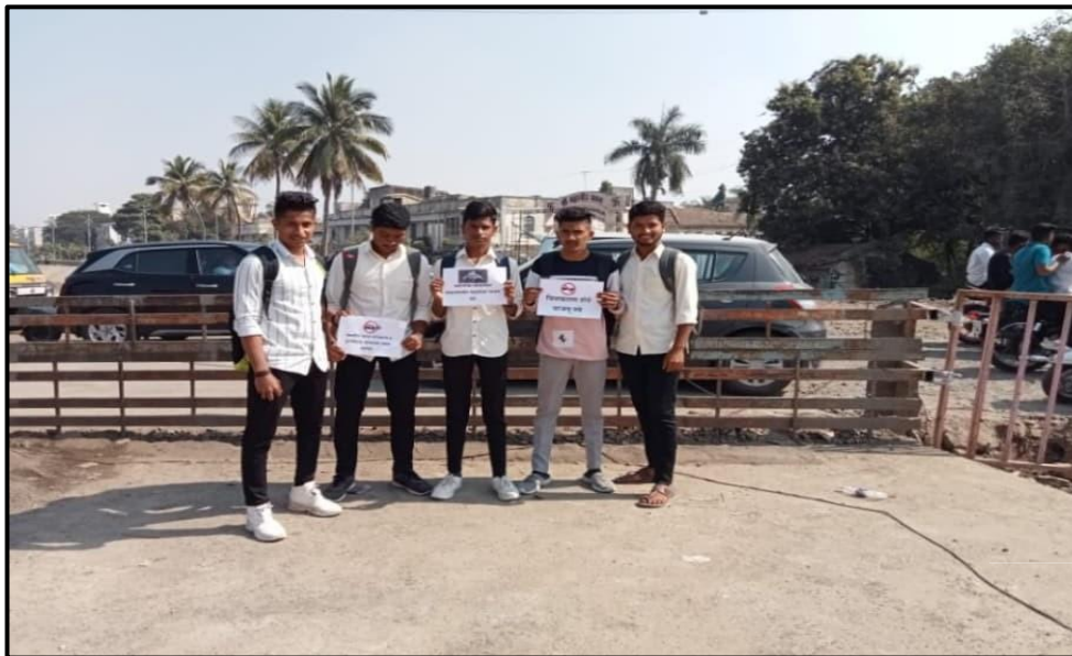
Noise Pollution Awareness by the Commerce students

Environmental Awareness was conducted by the department of Commerce during 15-30 October, 2022 for the students of commerce faculty. The activity aimed to create awareness among the students about environmental issues like pollution, climate change, over population, deforestation etc. The participant students visited different places in Baramati to understand the environmental problems like noise pollution, plastic garbage, biomedical waste affecting the eco system of the city. The students create awareness among the people by making posters and planting trees at different places in Baramati. The activity was conducted under the supervision of Dr. J.K. Pawar, Head of the Commerce department. Mr. S.M. Borawake guided the students in the activity. In total 15 students were involved actively for this awareness program.