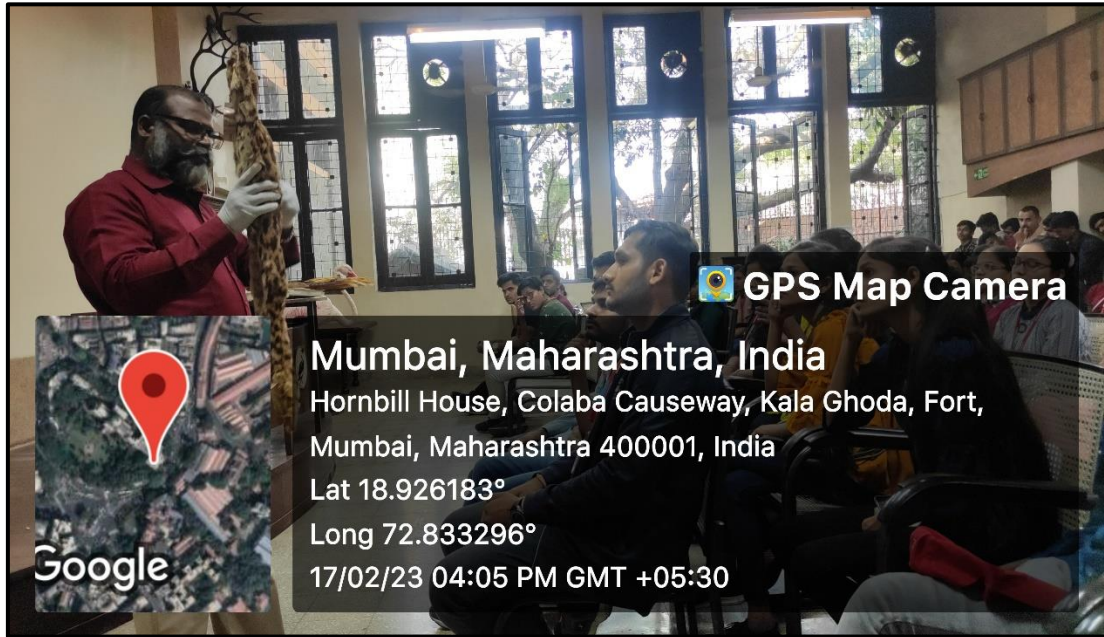
BNHS curator showing wildlife specimen to the students