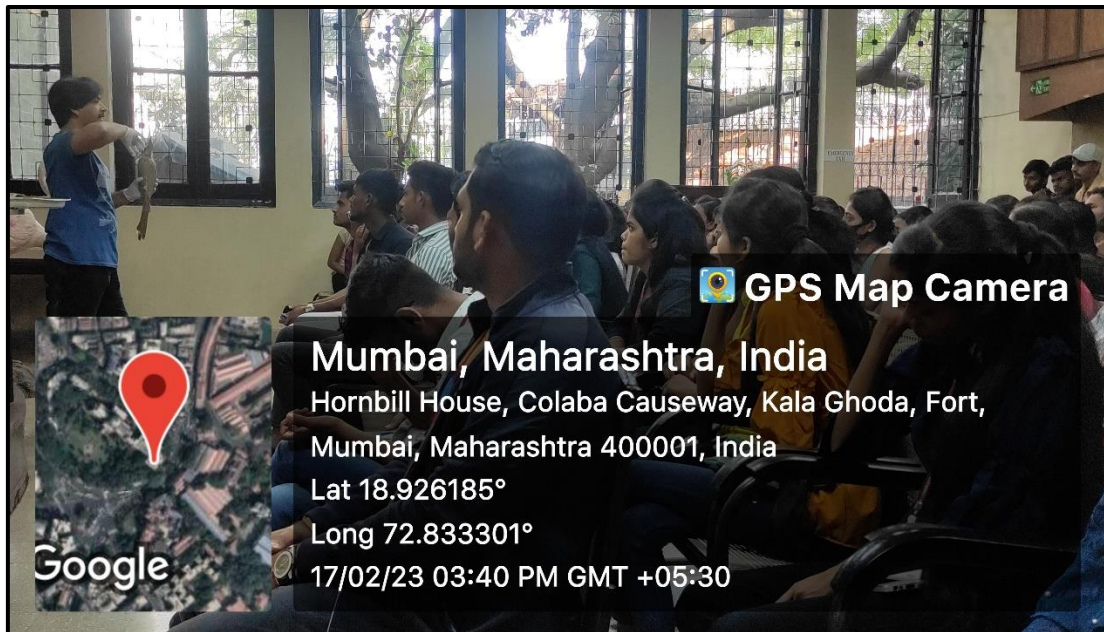
Interaction with BNHS curator