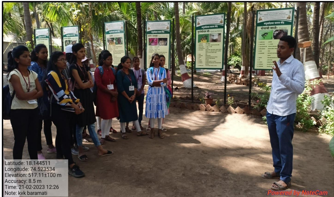
Experts from KVK guiding the students about environment conservation