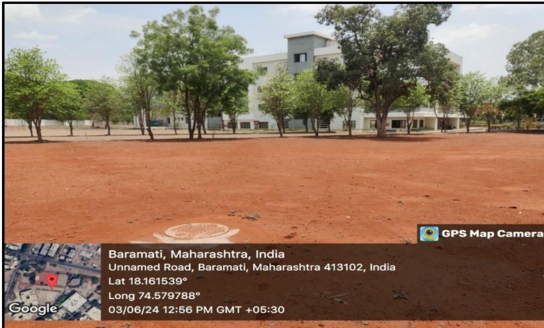
Behind Prashasan Bhavan, storage capacity 60000