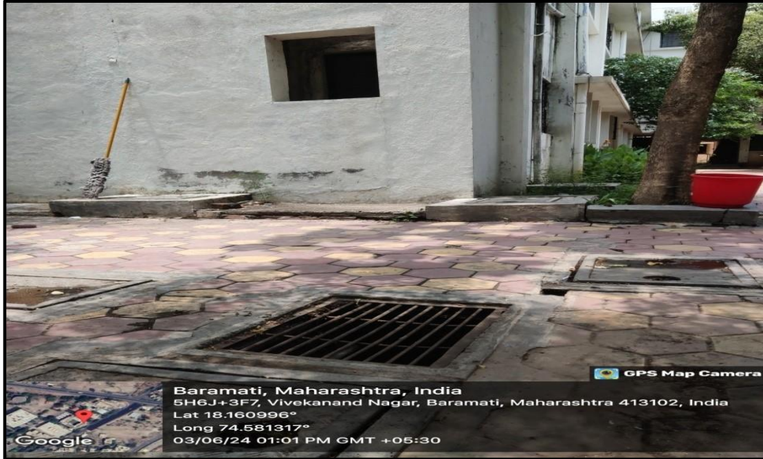
Near Ladies Hostel